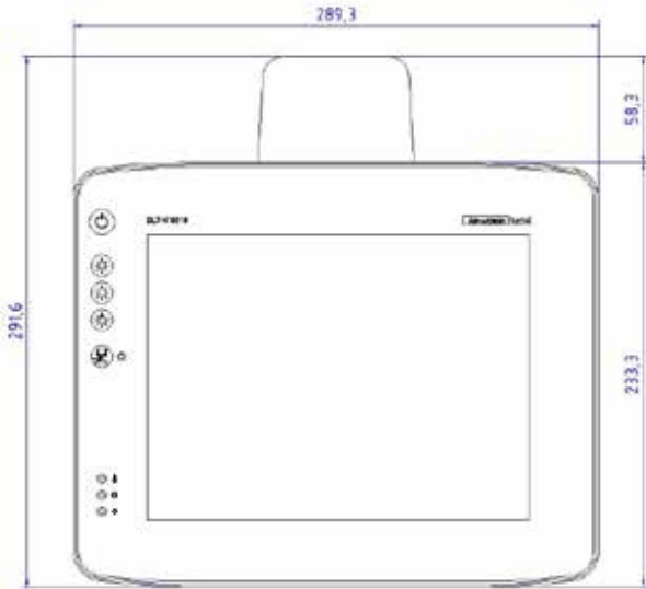
DLT-V8310 model example with Wi-Fi/WWAN/GPS Antenna