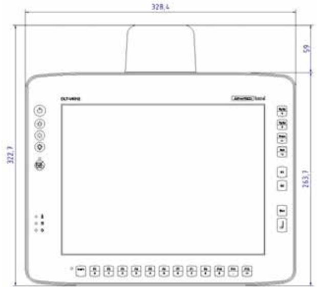
DLT-V8312 model example with Wi-Fi/WWAN/GPS Antenna