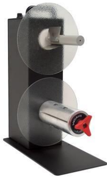
TWIN-CAT-2 Standard / C-76170

LABELMATE's Dual-Spindle Heavy Duty Unwinder / Rewinder, the TWIN-CAT-2 has two powerful motors and your choice of core holders. You therefore have maximum versatility in setting up the operation you need. Both spindles can rewind and unwind. You control the direction and torque on each spindle independently. An External Halt Control allows you to STOP and START the TWIN-CAT-2 with a foot switch or other external device if desired. A worldwide universal switching power supply is included.